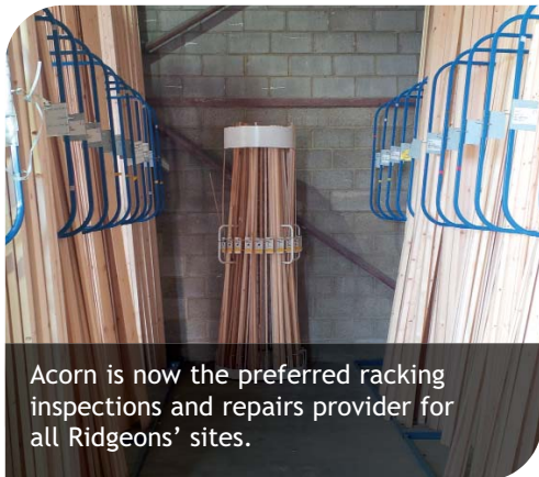
Acorn is now the preferred racking inspections and repairs provider for all Ridgeons' sites.

Acorn is now the preferred racking inspections and repairs provider for all Ridgeons' sites across East Anglia, also assessing and advising on load tolerances.