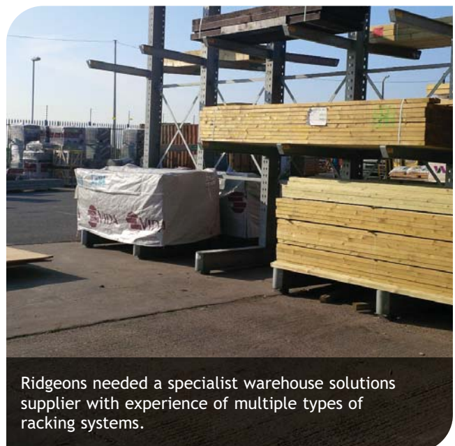
Ridgeons needed a specialist warehouse solutions supplier with experience of multiple types of racking systems.