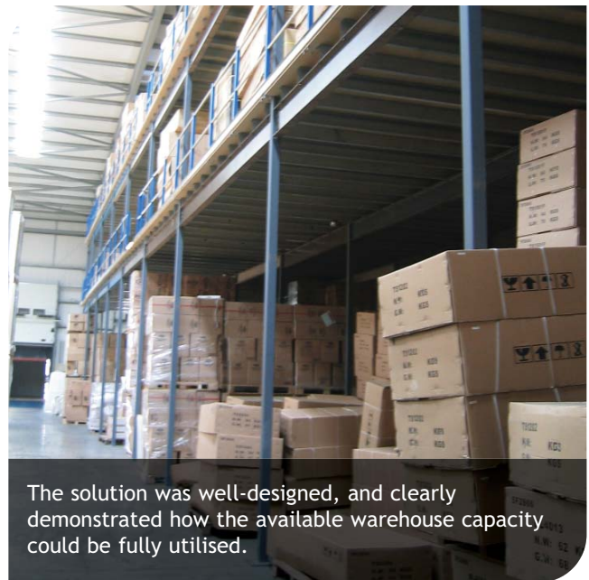
The solution was well-designed, and clearly demonstrated how the available warehouse capacity could be fully utilised.